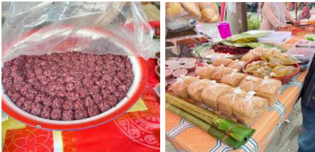
Figure 2. Tapai and Traditional Cakes from Batu Bara

Lemang, made from white glutinous rice and cooked in bamboo, has a sticky texture that the community symbolically interprets as a representation of the strong social bonds among residents. This characteristic reflects the values of unity and togetherness that are highly cherished in the life of the Batu Bara Malay community, where diversity in social, cultural, and economic backgrounds is united under a single collective identity as part of the local community. The presence of lemang at the tapai festival not only reflects the richness of traditional cuisine but also serves as a cultural symbol representing the importance of social solidarity and harmony in community life.