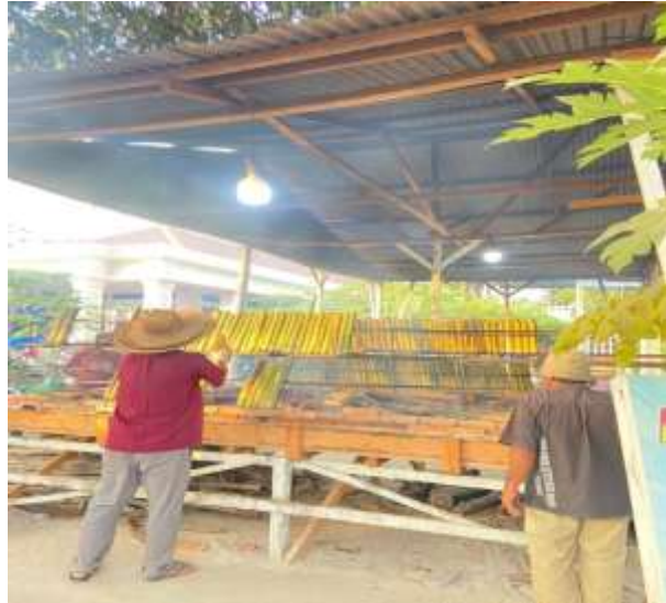
Figure 2. Traditional Lemang from Batu Bara